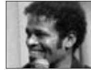
Mario Van Peebles