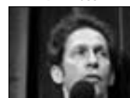
Tim Blake Nelson