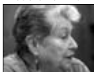
Anne V. Coates