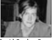
David Gordon Green