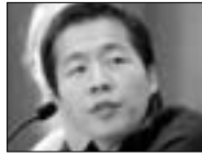
Lee Isaac Chung