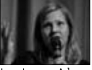
Joey Lauren Adams