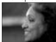
Daphne Maxwell Reid