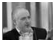
Matt Zoller Seitz