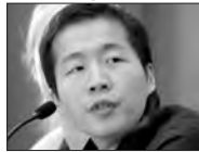
Lee Isaac Chung