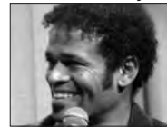
Mario Van Peebles