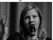
Joey Lauren Adams