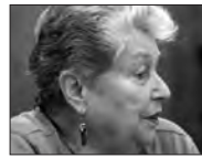
Anne V. Coates