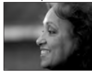
Daphne Maxwell Reid