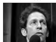
Tim Blake Nelson