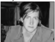
David Gordon Green