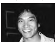
Jason Scott Lee