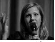
Joey Lauren Adams