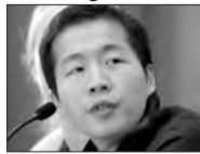
Lee Isaac Chung