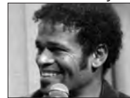
Mario Van Peebles