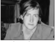
David Gordon Green