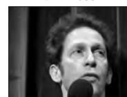
Tim Blake Nelson