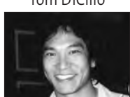
Jason Scott Lee