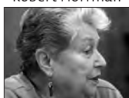
Anne V. Coates