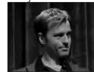
Trevor St. John