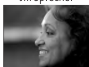
Daphne Maxwell Reid